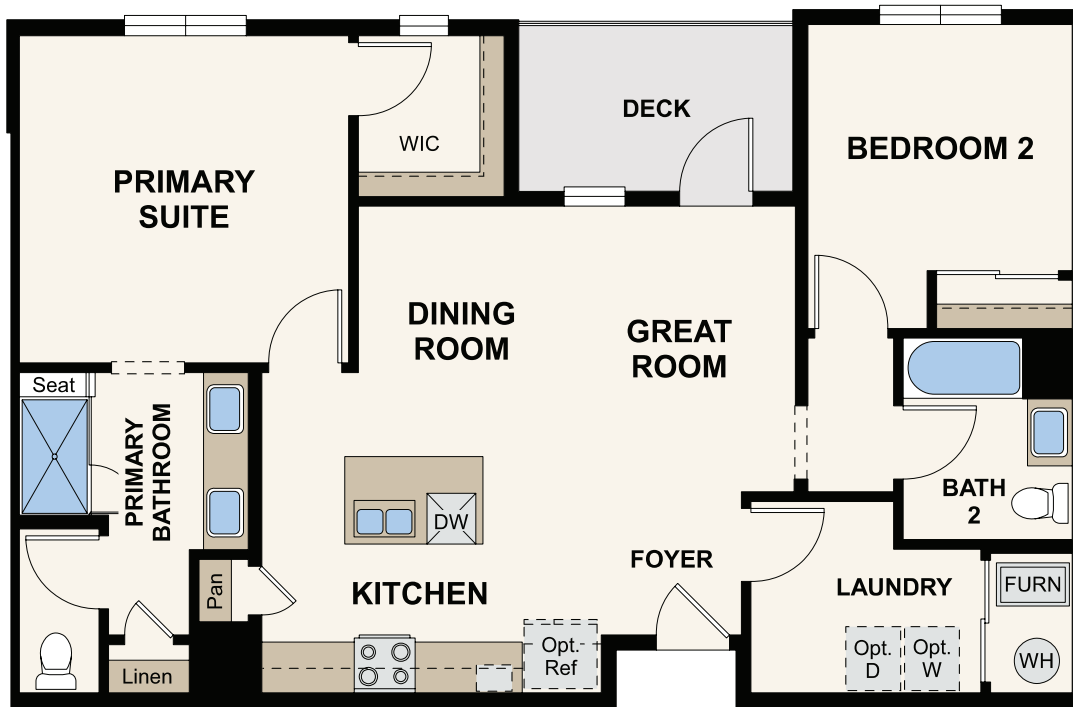
UNIT 2A - TYPE A FLOOR PLAN