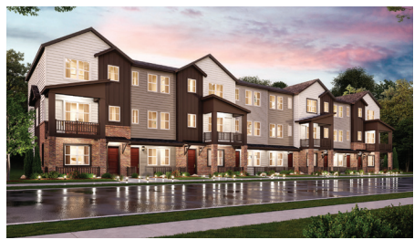
ELEVATION B - 8 PLEX