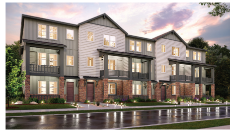
ELEVATION A - 5 PLEX