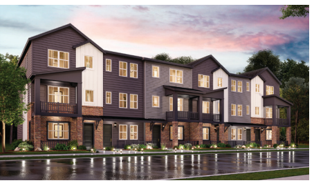
ELEVATION B - 6 PLEX