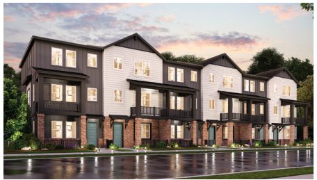
ELEVATION A - 6 PLEX