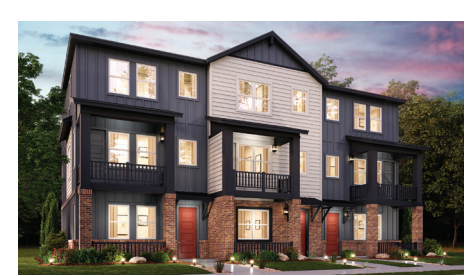
ELEVATION A - 3 PLEX

APPROX. 1,707 SQ. FT. | 3-STORY | 4 BEDROOMS | 3.5 BATHROOMS | 2-BAY GARAGE