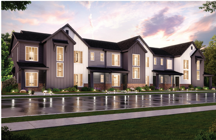
ELEVATION A - 6 PLEX