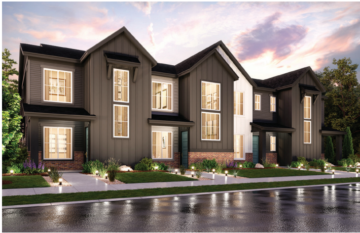
ELEVATION A - 4 PLEX

APPROX. 1,396 SQ. FT. | 2-STORY | 3 BEDROOMS | 2.5 BATHROOMS | 2-BAY GARAGE