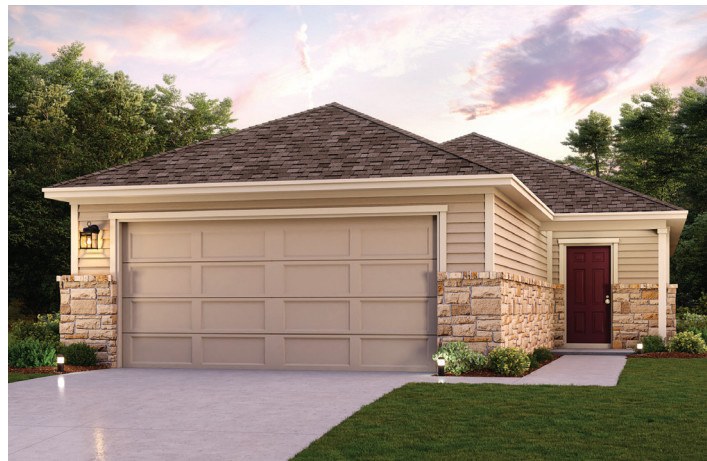
ELEVATION B WITH STONE